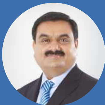
Shri Gautam Adani