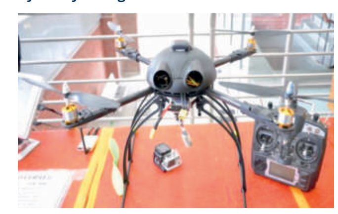
Student Innovative Project - Quad-Copter