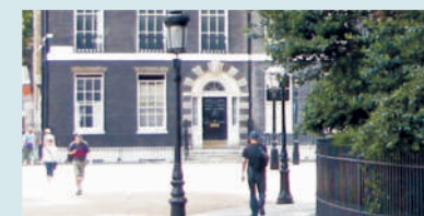
AMITY UNIVERSITY (IN) LONDON