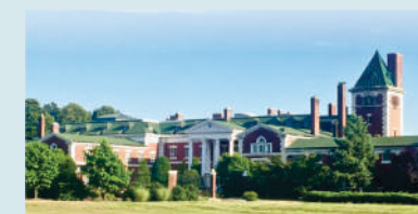
AMITY NEW YORK