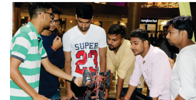
Student Innovative Project - Humanoid