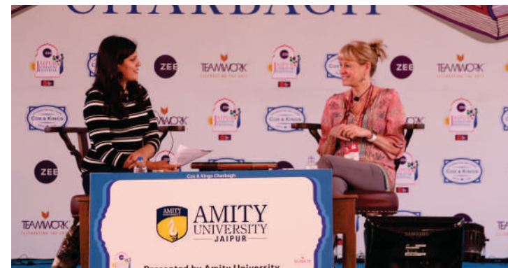
Amity University Rajasthan has been the Official University Partner of Jaipur Literature Festival for 3 years in a row.

Displaying great leadership and teamwork skills, Amitians leave a lasting impression wherever they go.