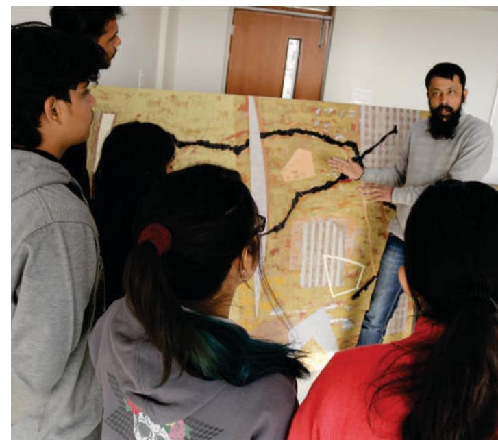
Amity University Rajasthan organized Amity Residency Program for Artists