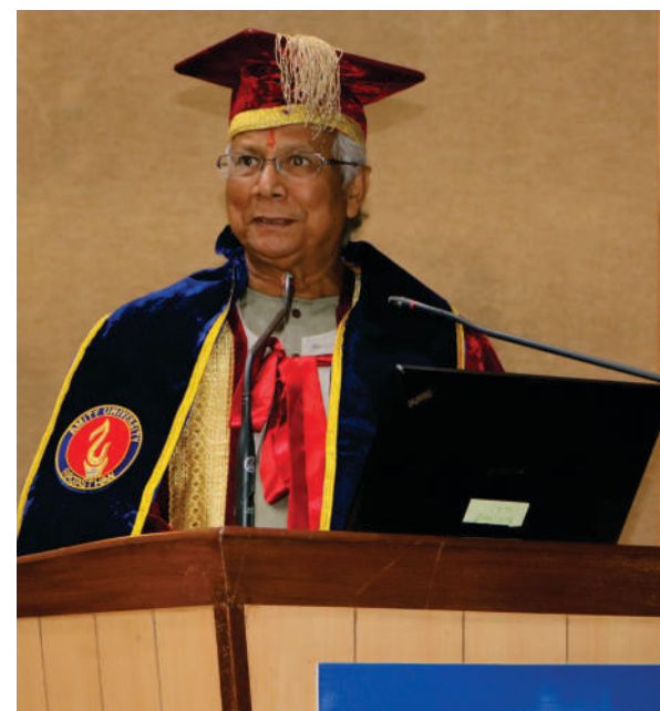
Nobel Laureate Muhammad Yunus shared his experience with students of Amity University Rajasthan.