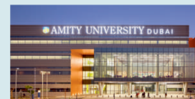
AMITY UNIVERSITY DUBAI

The Study Abroad Programme enables Amity Students to gain valuable international experience at Amity campuses in Dubai, Singapore, London, New York & USA. This unique programme spanning 6-8 weeks adds real value to students in the form of international experience and gaining a global perspective, and also enhances their resume for better career opportunities.