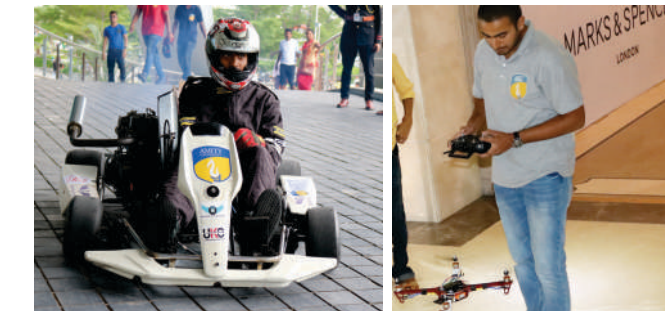
Amity F-1 Car