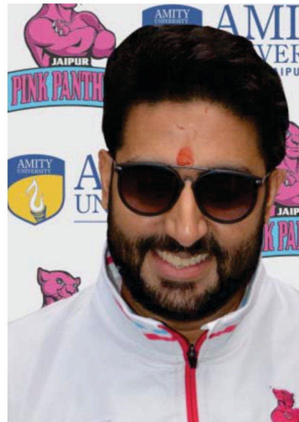
Mr. Abhishek Bachchan visited Amity University Rajasthan with his Pro Kabaddi Team.