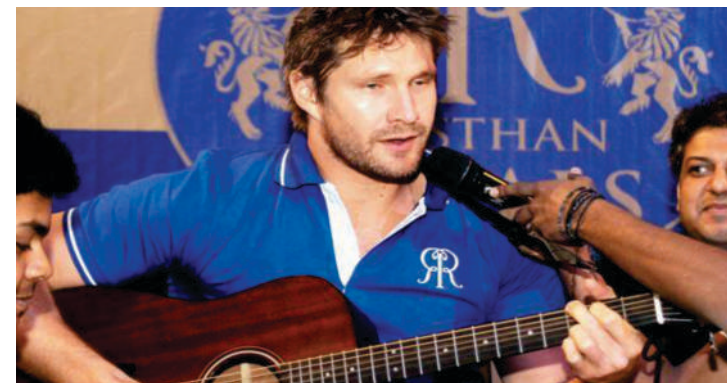
Rajasthan Royals Team's visit at Amity University Rajasthan