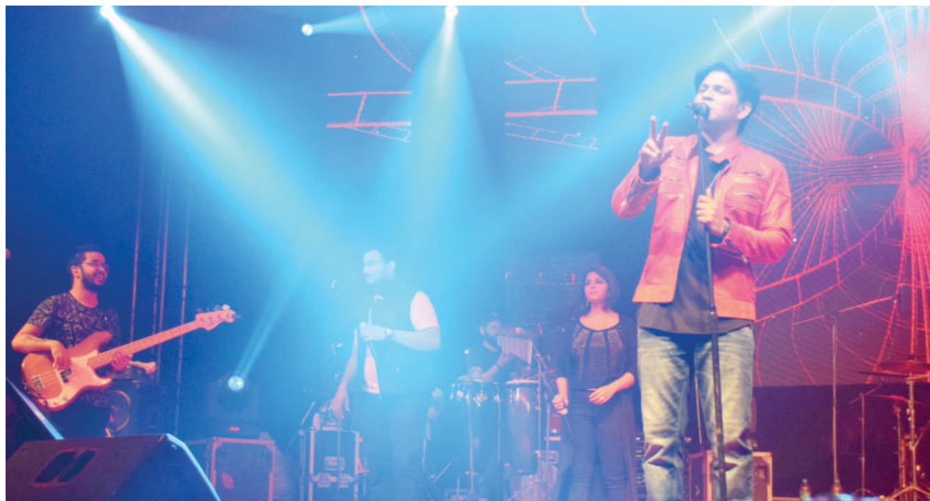
Ankit Tiwari Live Concert at Raipur City - Presented by Amity University Chhattisgarh.