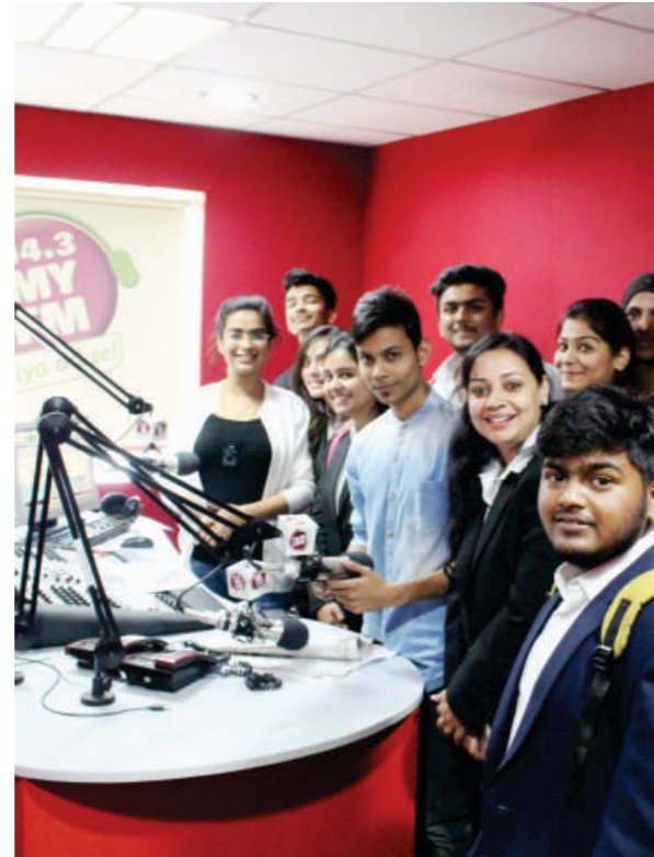
94.3 My FM Studio Visit of Amity University Chhattisgarh students.