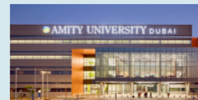
AMITY UNIVERSITY DUBAI

The Study Abroad Programme enables Amity Students to gain valuable international experience at Amity campuses in Dubai, Singapore, London, New York & USA. This unique programme spanning 6-8 weeks adds real value to students in the form of international experience and gaining a global perspective, and also enhances their resume for better career opportunities.