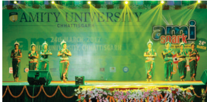
Annual Cultural Festival- AMISPARK

Displaying great leadership and teamwork skills, Amitiens leave a lasting impression wherever they go.