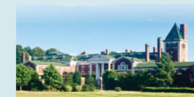
AMITY NEW YORK