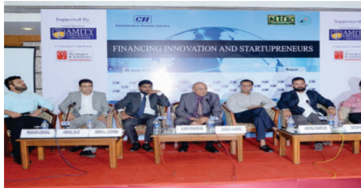
Amity University Chhattisgarh's representation as University Partner at CII event.