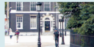
AMITY UNIVERSITY (IN) LONDON